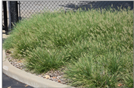
Cassian Dwarf Fountain Grass

Cassian Dwarf Fountain Grass will grow to be about 24 inches tall at maturity extending to 3 feet tall with the flowers, with a spread of 30 inches. It grows at a medium rate, and under ideal conditions can be expected to live for approximately 10 years. As an herbaceous perennial, this plant will usually die back to the crown each winter, and will regrow from the base each spring. Be careful not to disturb the crown in late winter when it may not be readily seen!