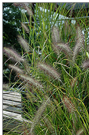
Cassian Dwarf Fountain Grass flowers