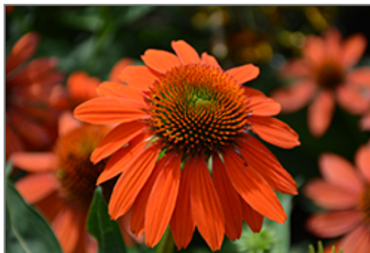
Sombrero Adobe Orange Coneflower flowers

Sombrero Adobe Orange Coneflower will grow to be about 24 inches tall at maturity, with a spread of 18 inches. Its foliage tends to remain dense right to the ground, not requiring facer plants in front. It grows at a medium rate, and under ideal conditions can be expected to live for approximately 10 years. As an herbaceous perennial, this plant will usually die back to the crown each winter, and will regrow from the base each spring. Be careful not to disturb the crown in late winter when it may not be readily seen!