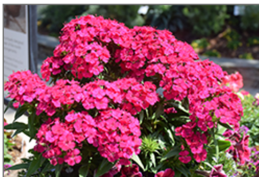
Amazon Neon Purple Pinks flowers

Amazon Neon Purple Pinks is recommended for the following landscape applications;