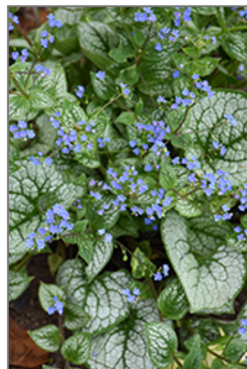
Sea Heart Bugloss flowers

Sea Heart Bugloss is recommended for the following landscape applications;