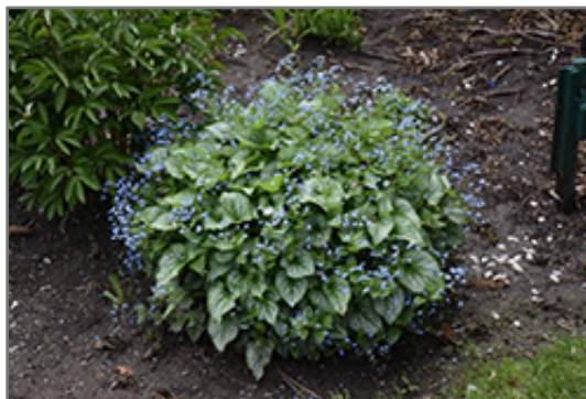
Sea Heart Bugloss in bloom

Sea Heart Bugloss will grow to be about 12 inches tall at maturity extending to 16 inches tall with the flowers, with a spread of 18 inches. When grown in masses or used as a bedding plant, individual plants should be spaced approximately 14 inches apart. It grows at a medium rate, and under ideal conditions can be expected to live for approximately 10 years. As an herbaceous perennial, this plant will usually die back to the crown each winter, and will regrow from the base each spring. Be careful not to disturb the crown in late winter when it may not be readily seen!