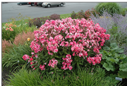
Garden Girls Glamour Girl Garden Phlox in bloom

Garden Girls Glamour Girl Garden Phlox will grow to be about 28 inches tall at maturity, with a spread of 24 inches. When grown in masses or used as a bedding plant, individual plants should be spaced approximately 18 inches apart. It grows at a medium rate, and under ideal conditions can be expected to live for approximately 10 years. As an herbaceous perennial, this plant will usually die back to the crown each winter, and will regrow from the base each spring. Be careful not to disturb the crown in late winter when it may not be readily seen!