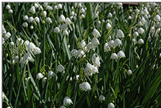
Gravetye Giant Summer Snowflake flowers

Gravetye Giant Summer Snowflake is recommended for the following landscape applications;