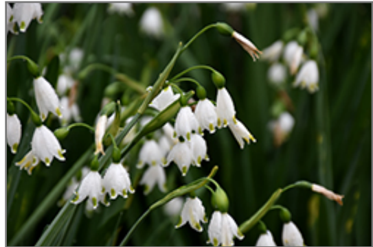
Gravetye Giant Summer Snowflake flowers

Gravetye Giant Summer Snowflake will grow to be about 18 inches tall at maturity extending to 28 inches tall with the flowers, with a spread of 18 inches. When grown in masses or used as a bedding plant, individual plants should be spaced approximately 14 inches apart. Its foliage tends to remain dense right to the ground, not requiring facer plants in front. It grows at a fast rate, and under ideal conditions can be expected to live for approximately 10 years. As an herbaceous perennial, this plant will usually die back to the crown each winter, and will regrow from the base each spring. Be careful not to disturb the crown in late winter when it may not be readily seen! As this plant tends to go dormant in summer, it is best interplanted with late-season bloomers to hide the dying foliage.