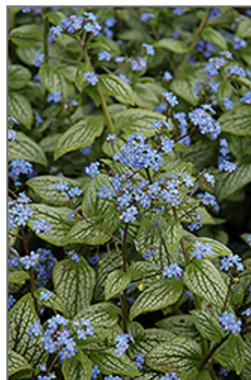
Silver Heart Bugloss flowers