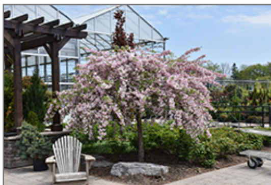
Louisa Flowering Crab in bloom

Louisa Flowering Crab is recommended for the following landscape applications;