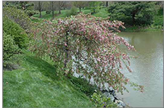
Louisa Flowering Crab in bloom

This plant is not reliably hardy in our region, and certain restrictions may apply; contact the store for more information.