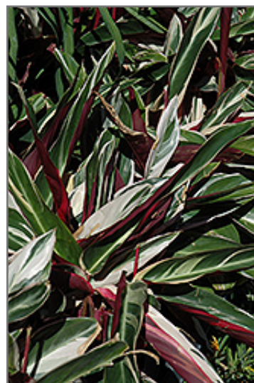
Tricolor Stromanthe foliage