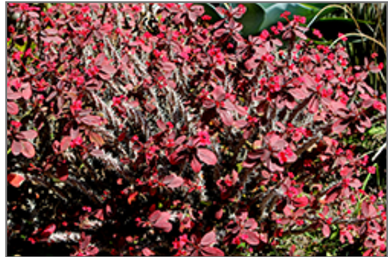
Crown Of Thorns in fall

Crown Of Thorns will grow to be about 6 feet tall at maturity, with a spread of 3 feet. It has a low canopy with a typical clearance of 1 foot from the ground. Although it's not a true annual, this slow-growing plant can be expected to behave as an annual in our climate if left outdoors over the winter, usually needing replacement the following year. As such, gardeners should take into consideration that it will perform differently than it would in its native habitat.