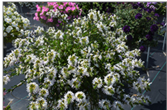
White Sparkle Fan Flower in bloom