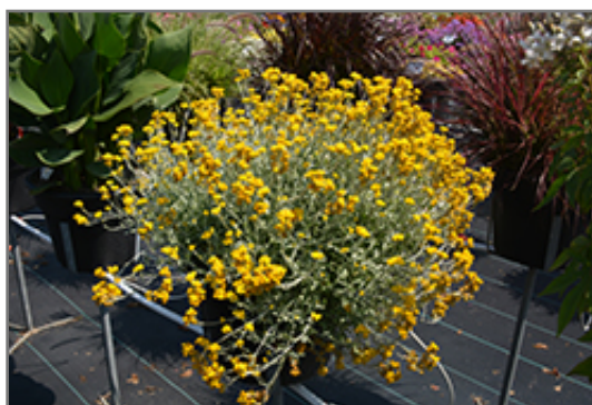
Flambe Yellow Strawflower in bloom