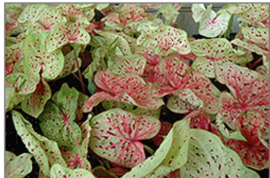
Miss Muffet Caladium foliage