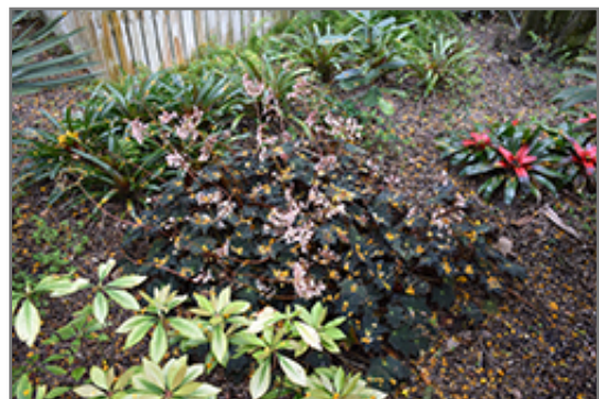
Joe Hayden Begonia in bloom