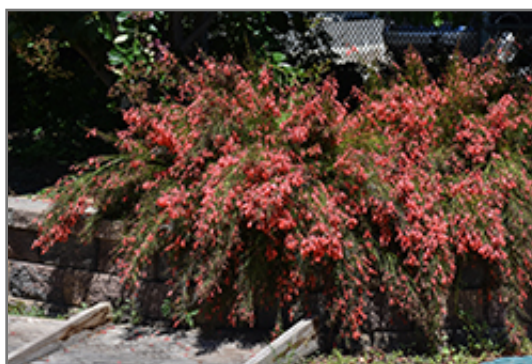
Firecracker Plant in bloom