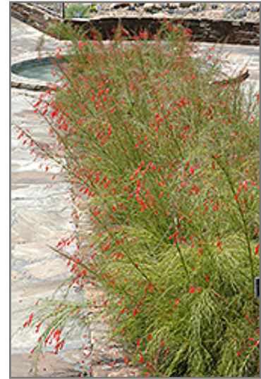
Firecracker Plant in bloom

Firecracker Plant is a fine choice for the garden, but it is also a good selection for planting in outdoor containers and hanging baskets. Because of its height, it is often used as a 'thriller' in the 'spiller-thriller-filler' container combination; plant it near the center of the pot, surrounded by smaller plants and those that spill over the edges. It is even sizeable enough that it can be grown alone in a suitable container. Note that when growing plants in outdoor containers and baskets, they may require more frequent waterings than they would in the yard or garden.