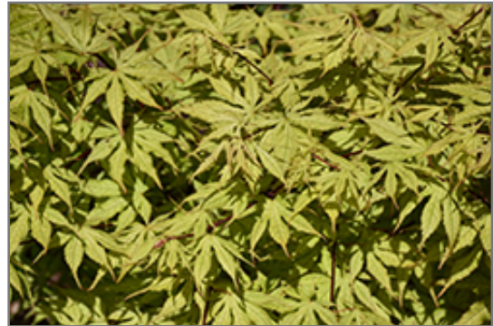
Grandma Ghost Japanese Maple foliage