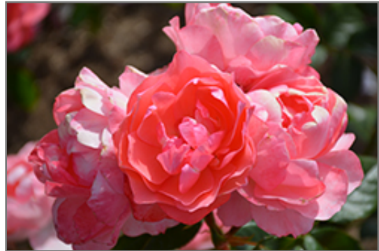
Passionate Kisses Rose flowers