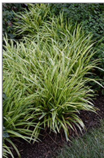
Marc Anthony Lily Turf