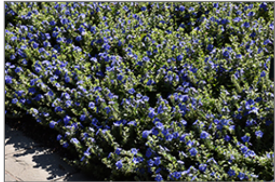
Blue My Mind Morning Glory in bloom

Blue My Mind Morning Glory is a fine choice for the garden, but it is also a good selection for planting in outdoor containers and hanging baskets. Because of its spreading habit of growth, it is ideally suited for use as a 'spiller' in the 'spiller-thriller-filler' container combination; plant it near the edges where it can spill gracefully over the pot. Note that when growing plants in outdoor containers and baskets, they may require more frequent waterings than they would in the yard or garden.