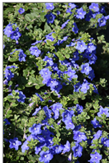
Blue My Mind Morning Glory flowers