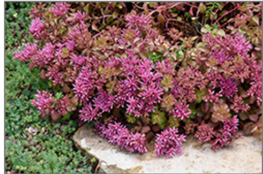
Ruby Mantle Stonecrop flowers

Ruby Mantle Stonecrop is recommended for the following landscape applications;