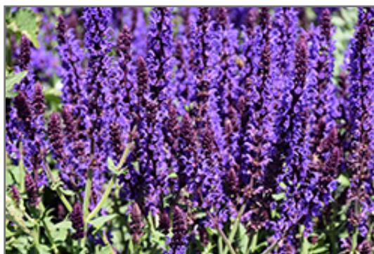
Lyrical Blues Meadow Sage flowers

Lyrical Blues Meadow Sage is recommended for the following landscape applications;