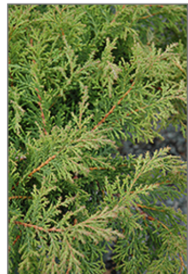
Fuzzball Siberian Carpet Cypress foliage