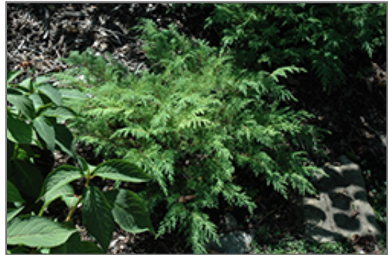
Fuzzball Siberian Carpet Cypress

This shrub does best in partial shade to shade. It does best in average to evenly moist conditions, but will not tolerate standing water. It is not particular as to soil type or pH. It is quite intolerant of urban pollution, therefore inner city or urban streetside plantings are best avoided, and will benefit from being planted in a relatively sheltered location. Consider applying a thick mulch around the root zone in winter to protect it in exposed locations or colder microclimates. This is a selected variety of a species not originally from North America.