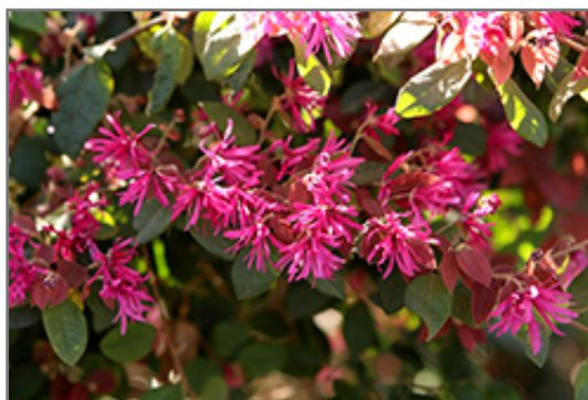
Blush Chinese Fringeflower flowers