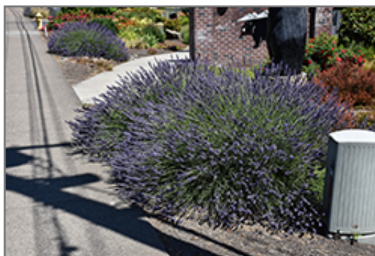
Phenomenal Lavender in bloom

Phenomenal Lavender is recommended for the following landscape applications;