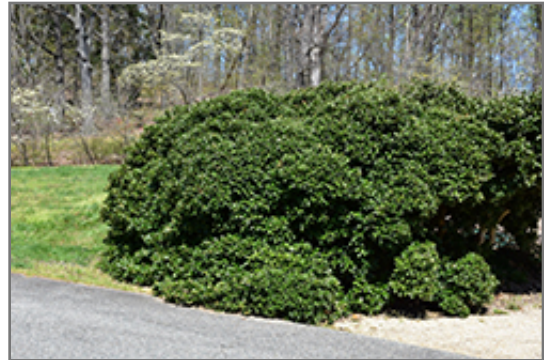
Rotunda Chinese Holly