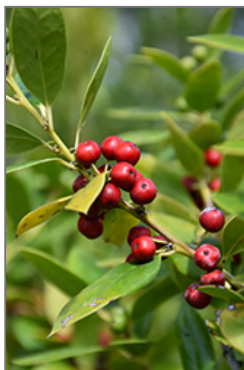
Needlepoint Chinese Holly fruit