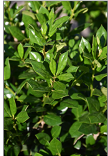
Needlepoint Chinese Holly foliage

This plant is not reliably hardy in our region, and certain restrictions may apply; contact the store for more information.