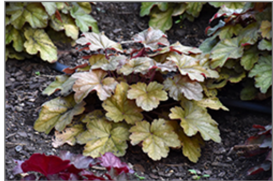
Carnival Coffee Bean Coral Bells

Carnival Coffee Bean Coral Bells will grow to be about 12 inches tall at maturity, with a spread of 14 inches. When grown in masses or used as a bedding plant, individual plants should be spaced approximately 12 inches apart. Its foliage tends to remain dense right to the ground, not requiring facer plants in front. It grows at a medium rate, and under ideal conditions can be expected to live for approximately 10 years. As an evergreen perennial, this plant will typically keep its form and foliage year-round.