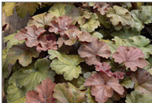
Carnival Coffee Bean Coral Bells foliage

Carnival Coffee Bean Coral Bells is recommended for the following landscape applications;