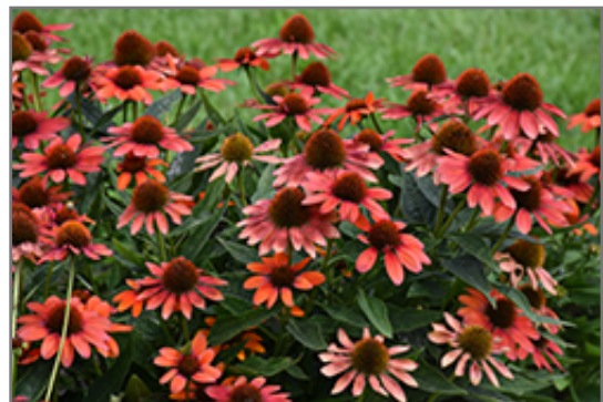
Sombrero Flamenco Orange Coneflower flowers