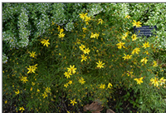
Electric Avenue Tickseed in bloom