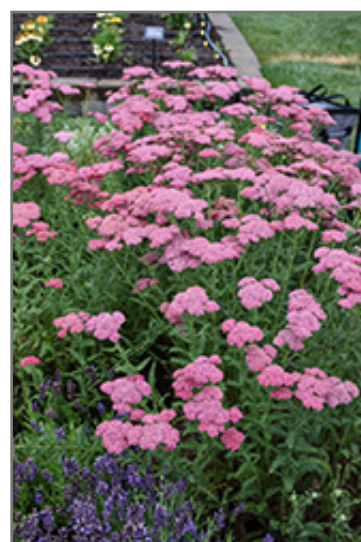
New Vintage Rose Yarrow in bloom