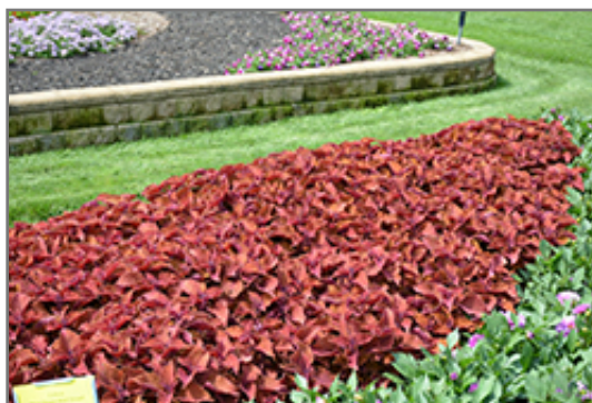
Wall Street Coleus