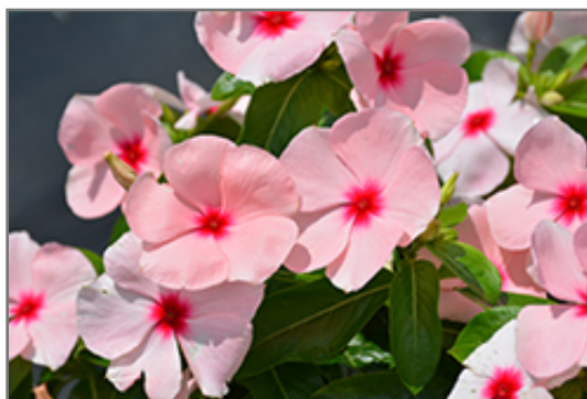
Titan Apricot Vinca flowers

Titan Apricot Vinca is recommended for the following landscape applications;