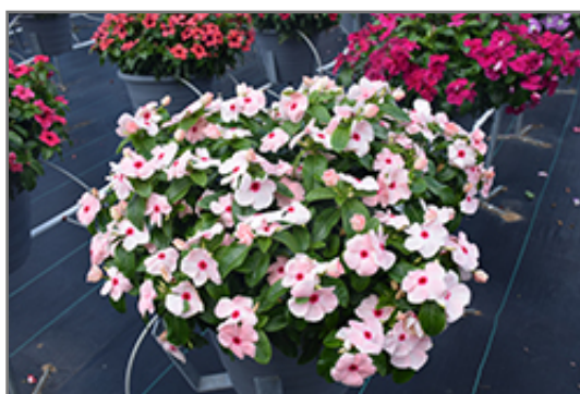
Titan Apricot Vinca in bloom