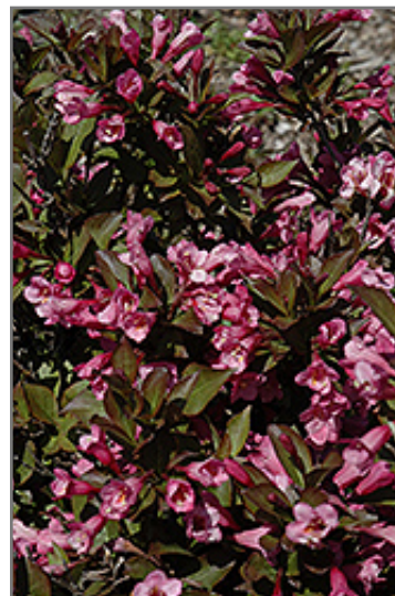
Rumba Weigela flowers