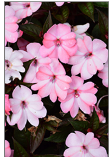
SunPatiens Compact Blush Pink New Guinea Impatiens flowers