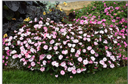
SunPatiens Compact Blush Pink New Guinea Impatiens in bloom

SunPatiens Compact Blush Pink New Guinea Impatiens is recommended for the following landscape applications;