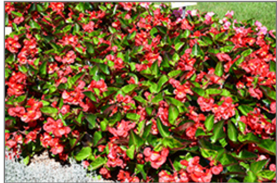
Big Red Green Leaf Begonia in bloom

Big Red Green Leaf Begonia will grow to be about 18 inches tall at maturity, with a spread of 18 inches. When grown in masses or used as a bedding plant, individual plants should be spaced approximately 16 inches apart. Its foliage tends to remain dense right to the ground, not requiring facer plants in front. Although it's not a true annual, this plant can be expected to behave as an annual in our climate if left outdoors over the winter, usually needing replacement the following year. As such, gardeners should take into consideration that it will perform differently than it would in its native habitat.