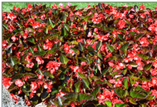
Big Red Bronze Leaf Begonia in bloom

Big Red Bronze Leaf Begonia will grow to be about 18 inches tall at maturity, with a spread of 18 inches. When grown in masses or used as a bedding plant, individual plants should be spaced approximately 16 inches apart. Its foliage tends to remain dense right to the ground, not requiring facer plants in front. Although it's not a true annual, this plant can be expected to behave as an annual in our climate if left outdoors over the winter, usually needing replacement the following year. As such, gardeners should take into consideration that it will perform differently than it would in its native habitat.