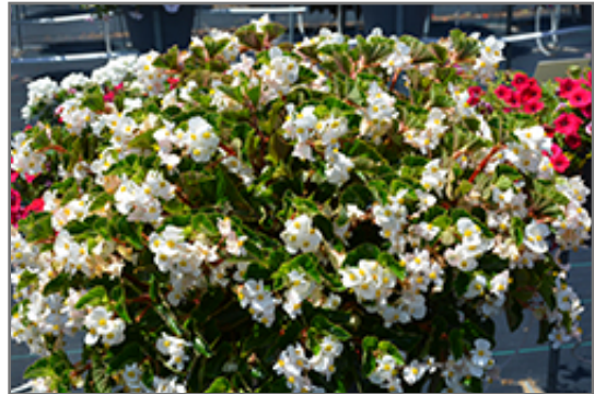
BabyWing White Begonia in bloom

BabyWing White Begonia is a fine choice for the garden, but it is also a good selection for planting in outdoor containers and hanging baskets. It is often used as a 'filler' in the 'spiller-thriller-filler' container combination, providing a mass of flowers and foliage against which the thriller plants stand out. Note that when growing plants in outdoor containers and baskets, they may require more frequent waterings than they would in the yard or garden.