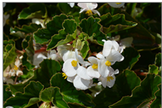
BabyWing White Begonia flowers