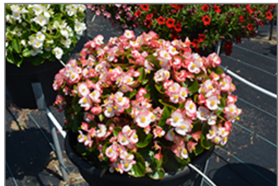
Super Olympia Bicolor Begonia in bloom