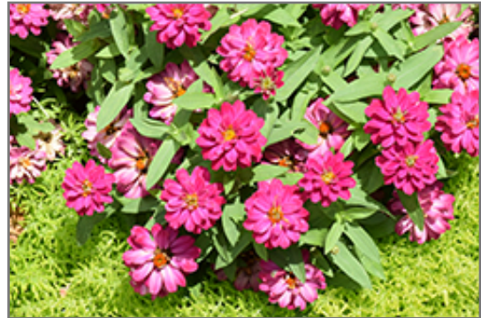
Zahara Double Cherry Zinnia flowers

Zahara Double Cherry Zinnia will grow to be about 16 inches tall at maturity, with a spread of 16 inches. When grown in masses or used as a bedding plant, individual plants should be spaced approximately 12 inches apart. Its foliage tends to remain dense right to the ground, not requiring facer plants in front. This fast-growing annual will normally live for one full growing season, needing replacement the following year.