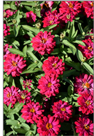
Zahara Double Cherry Zinnia flowers

Zahara Double Cherry Zinnia is recommended for the following landscape applications;