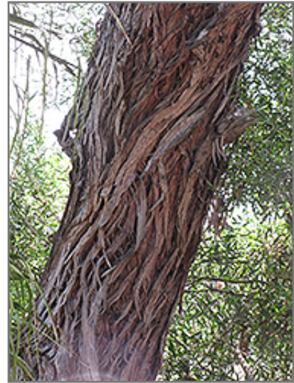
Narrow-Leaved Black Peppermint bark

This plant is not reliably hardy in our region, and certain restrictions may apply; contact the store for more information.