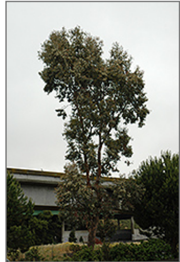
Narrow-Leaved Black Peppermint