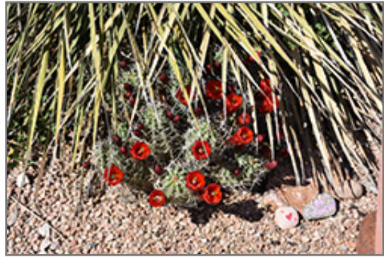
Mexican Claret Cup in bloom