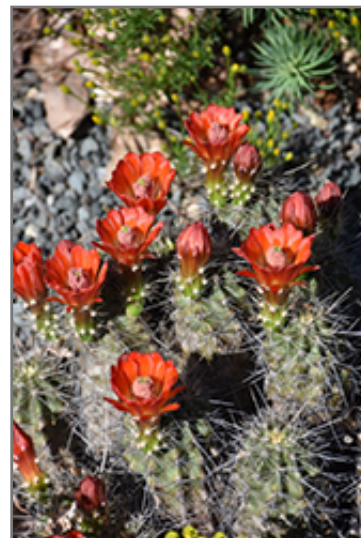
Mexican Claret Cup flowers

Mexican Claret Cup is a succulent evergreen plant with a strongly upright, cylindrical form. It tends to grow as a solitary entity comprised of a single stem, and it doesn't usually spread laterally. As a type of cactus, it has no true foliage; the body of the plant is wholly comprised of a spiny grayish green stem which is prominently ribbed.