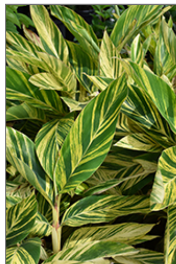
Variegated Shell Ginger foliage