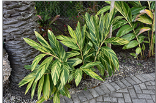
Variegated Shell Ginger

Variegated Shell Ginger is a fine choice for the garden, but it is also a good selection for planting in outdoor pots and containers. Because of its height, it is often used as a 'thriller' in the 'spiller-thriller-filler' container combination; plant it near the center of the pot, surrounded by smaller plants and those that spill over the edges. It is even sizeable enough that it can be grown alone in a suitable container. Note that when growing plants in outdoor containers and baskets, they may require more frequent waterings than they would in the yard or garden.