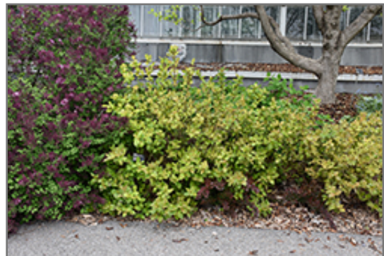
Wings Of Fire Weigela