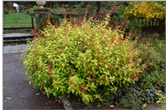
Golden Delicious Pineapple Sage in bloom

Golden Delicious Pineapple Sage is recommended for the following landscape applications;