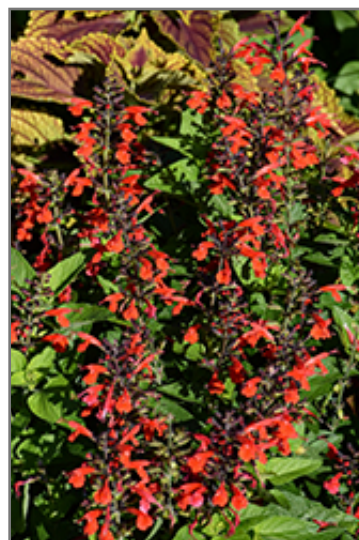
Forest Fire Sage flowers

Forest Fire Sage is recommended for the following landscape applications;