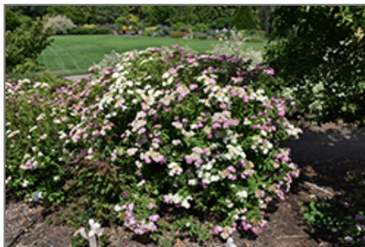
Shirobana Spirea in bloom