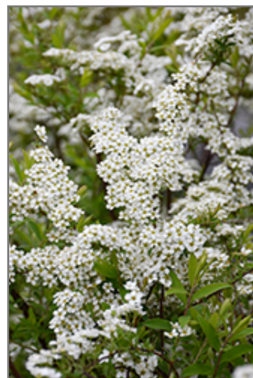
Dwarf Garland Spirea flowers