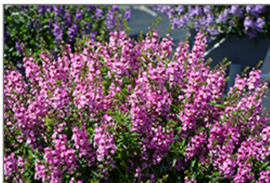
Serenita Raspberry Angelonia in bloom