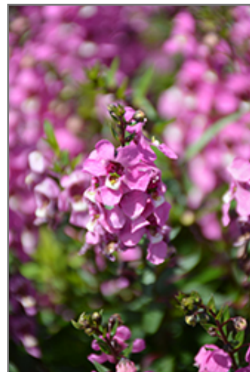
Serenita Raspberry Angelonia flowers

Serenita Raspberry Angelonia is a fine choice for the garden, but it is also a good selection for planting in outdoor containers and hanging baskets. It is often used as a 'filler' in the 'spiller-thriller-filler' container combination, providing a mass of flowers against which the larger thriller plants stand out. Note that when growing plants in outdoor containers and baskets, they may require more frequent waterings than they would in the yard or garden.