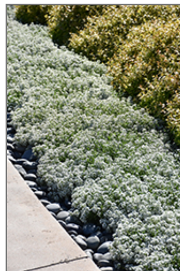
Snow Princess Alyssum in bloom

Snow Princess Alyssum is recommended for the following landscape applications;