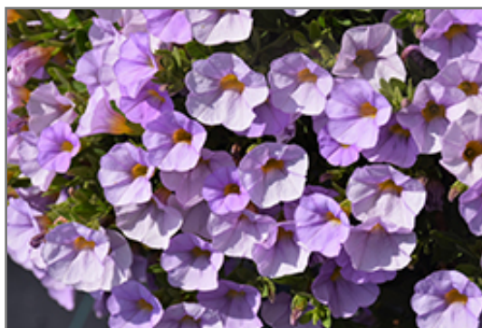
Superbells Miss Lilac Calibrachoa flowers